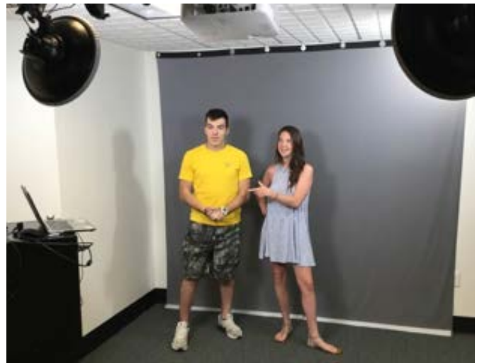
Pictured is just some of the technology you and our students can experience in our open labs.

The MWM open lab is a collaborative space that includes moveable furniture (28 chairs and 14 flat tables), extra chairs for presentations (the room holds 70), a computer cart that includes a platform document camera that will allow you to project 3D objects or capture a brainstorming session.